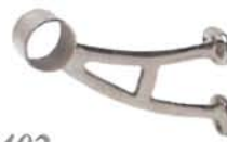
402 Bar Mount Bracket