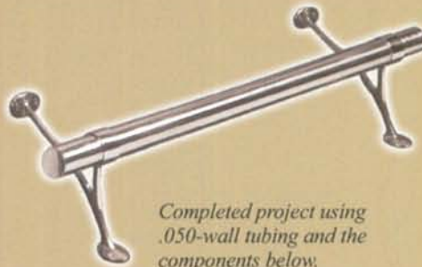
Completed project using .050-wall tubing and the components below.