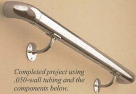
Completed project using .050-wall tubing and the components below.