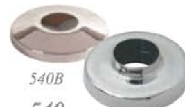
540 Cover Plates