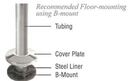
Recommended Floor-mounting using B-mount

A strong structural adhesive for joining metal components, Lido Weld will simplify your project assembly, while achieving a professional look.