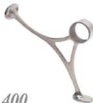
400 Combination Bracket