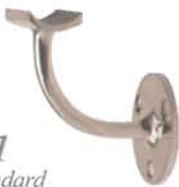
301 Standard Handrail Bracket