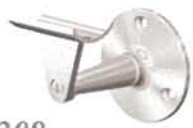
308 Handrail Bracket